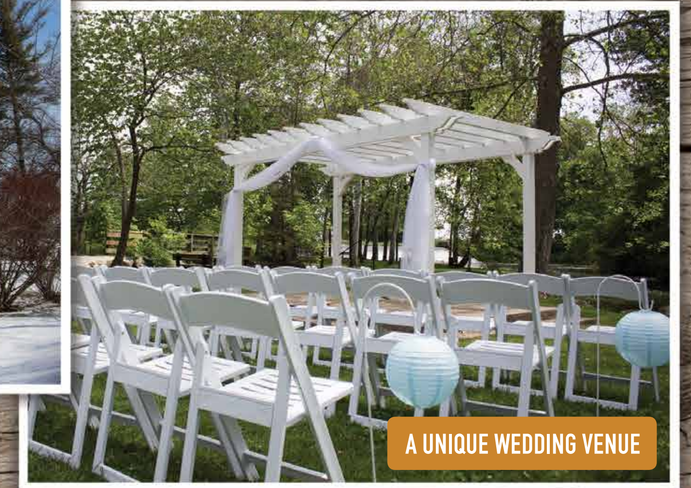
A UNIQUE WEDDING VENUE