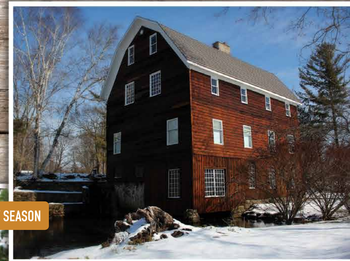
BEAUTIFUL IN EVERY SEASON

In 2015, St. Joseph County Parks and Recreation staff embarked on extensive renovations to the grounds and mill, hoping to recapture the property's historical and cultural value for St. Joseph County residents.