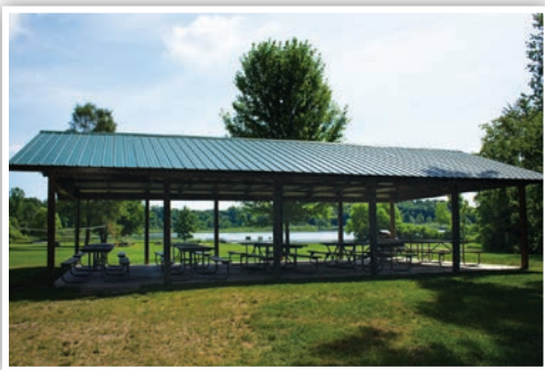
CADE LAKE PARK & CAMPGROUND 10 picnic tables, electricity, rustic grills.

Pavilion rental includes (20) single use Vehicle Day Passes for the park, picnic tables and access to trash receptacles.