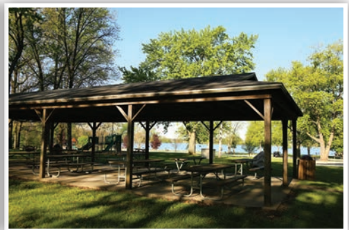
SAND LAKE PARK Picnic tables, rustic grills, electricity.

Shelter Rentals and Group Outings 1. All group outings at a County Park require a reservation and permit. 2. Shelters can be reserved starting on January 1 of the previous year. 3. Completely fill out shelter reservation form available at St. Joseph County Parks Headquarters or call (269) 467-5519. 4. Make full payment for reservation. (Make checks payable to St. Joseph County Parks.) 5. Shelters will be held over the phone for ten business days and will be cancelled if registration and payment are not received. 6. Shelter reservation fees are non-refundable. 7. If reserving through the mail, you must pay with a check or money order. 8. If reserving through the mail, you will be notified of reservation confirmation and payment received.