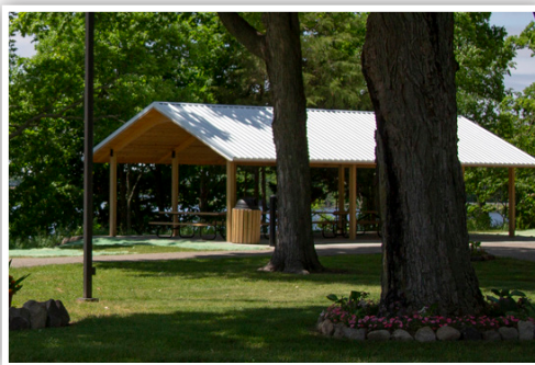
COVERED BRIDGE FARM 6 picnic tables, electricity.