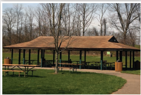
MEYER BROADWAY PARK Original - 10 picnic tables, electricity. Playground - 8 picnic tables, electricity.