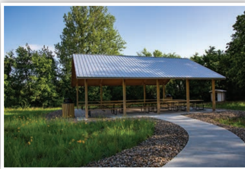
PLUMB LAKE PARK 2 pavilions available, 8 picnic tables. (Lakeside & Woodland)