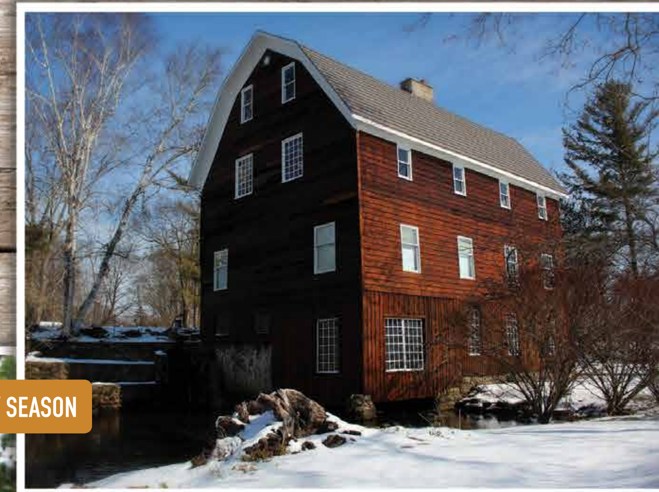
BEAUTIFUL IN EVERY SEASON

In 2015, St. Joseph County Parks and Recreation staff embarked on extensive renovations to the grounds and mill, hoping to recapture the property's historical and cultural value for St. Joseph County residents.