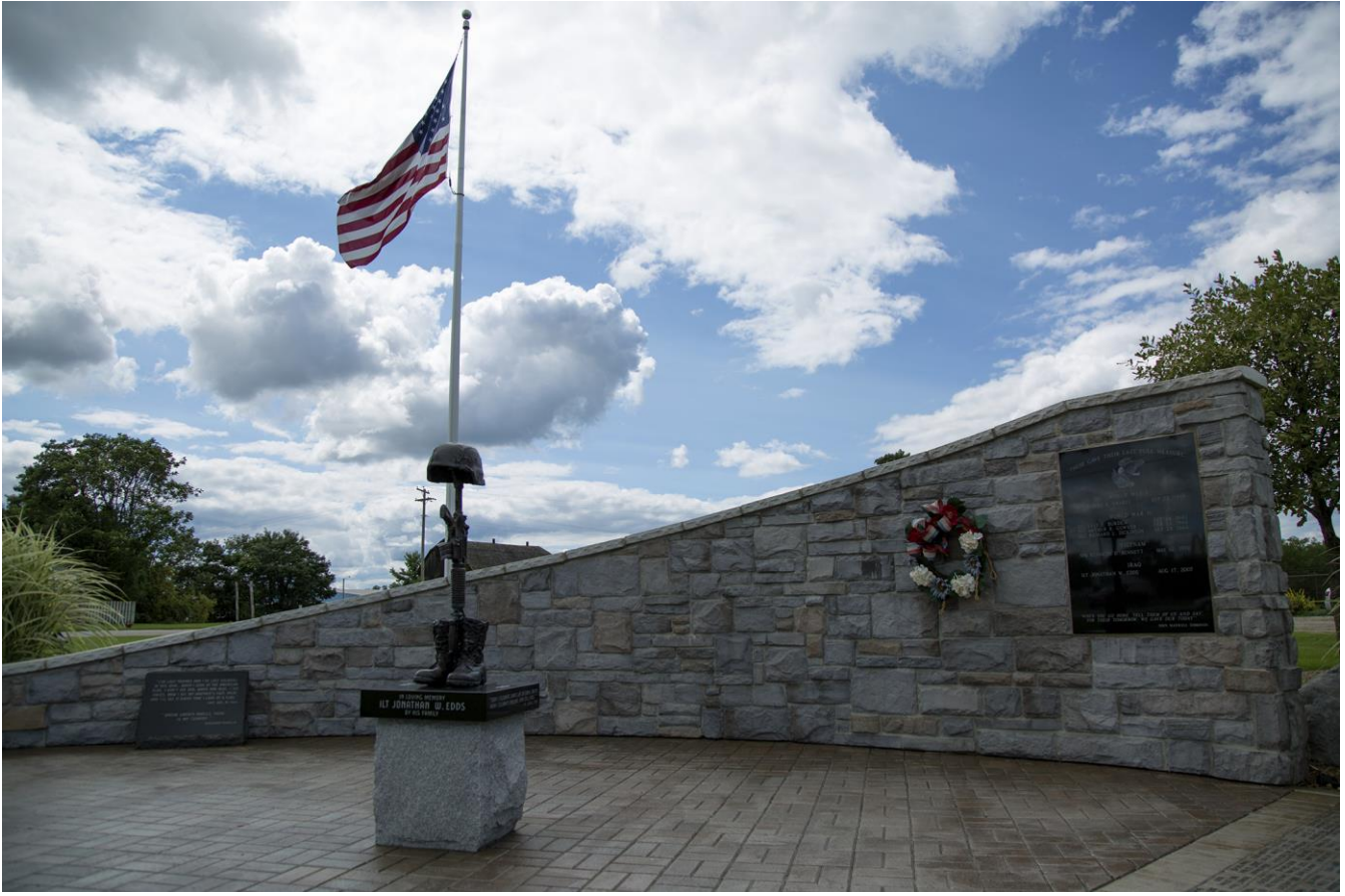
Wabememe Memorial Park For information on our parks visit: www.stjosephcountymi.org/parks

Prepared by: St Joseph County Equalization Department