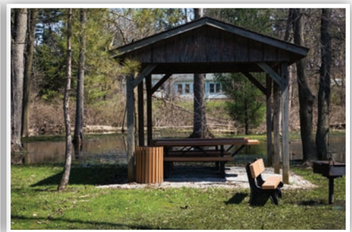
RAWSON'S KING MILL PARK Picnic tables, electricity, rustic grills.