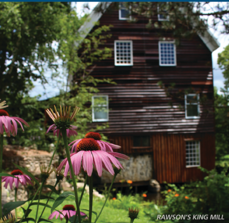
RAWSON'S KING MILL

Need help transporting to and from launch points? For this river we suggest the following business: